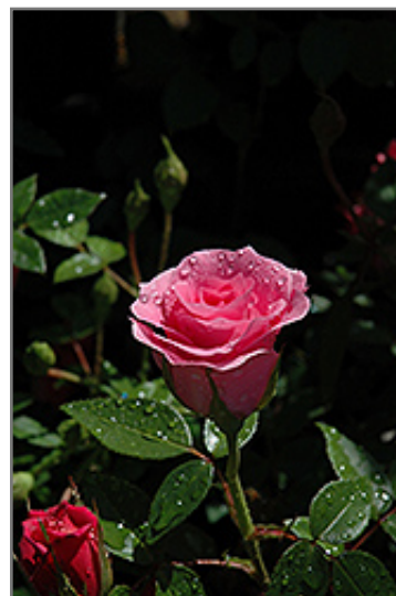
Belle Danielle Rose flowers