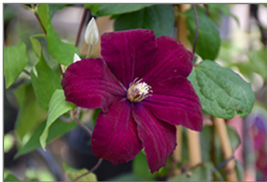
Rouge Cardinal Clematis flowers