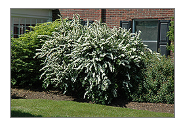
Renaissance Spirea in bloom