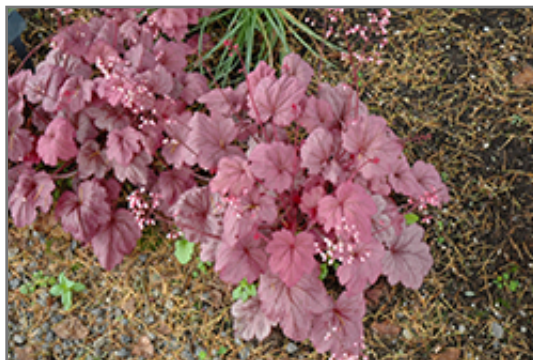
Georgia Plum Coral Bells