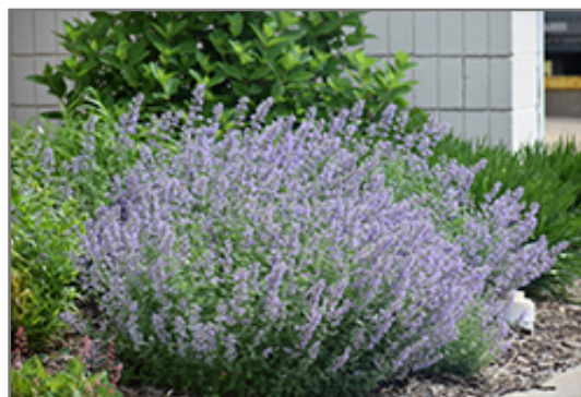
Cat's Meow Catmint in bloom