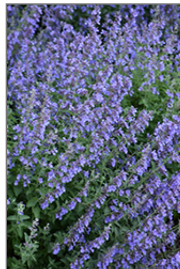
Cat's Meow Catmint flowers

Cat's Meow Catmint is recommended for the following landscape applications;