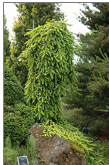
Gold Drift Norway Spruce