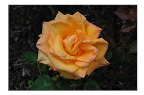
Chris Evert Rose flowers

Chris Evert Rose is recommended for the following landscape applications;