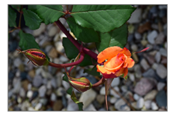
Chris Evert Rose flower buds