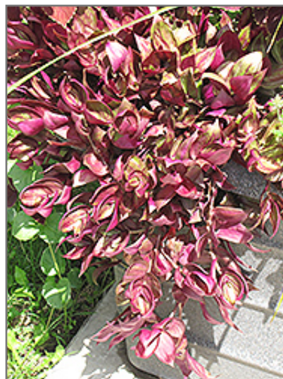
Purple Wandering Jew

Purple Wandering Jew is recommended for the following landscape applications;