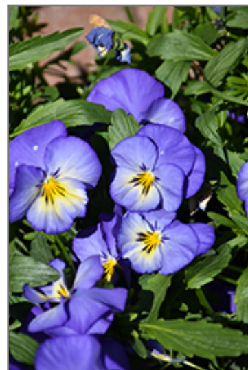
Halo Sky Blue Pansy flowers