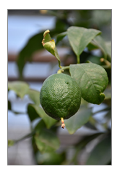
Persian Lime fruit

Persian Lime features showy clusters of fragrant white star-shaped flowers with yellow eyes at the ends of the branches from late winter to early spring. It has attractive dark green evergreen foliage. The glossy oval leaves are highly ornamental and remain dark green throughout the winter. It features an abundance of magnificent green berries in mid summer.