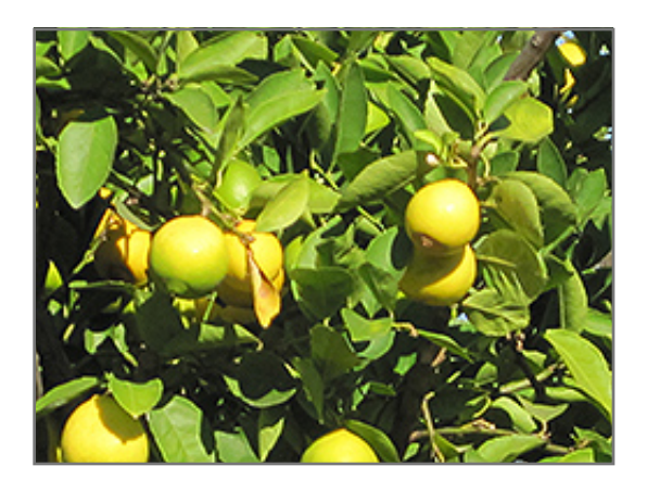
Persian Lime fruit