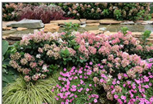
Little Quick Fire Hydrangea in bloom

Little Quick Fire Hydrangea makes a fine choice for the outdoor landscape, but it is also well-suited for use in outdoor pots and containers. With its upright habit of growth, it is best suited for use as a 'thriller' in the 'spiller-thriller-filler' container combination; plant it near the center of the pot, surrounded by smaller plants and those that spill over the edges. It is even sizeable enough that it can be grown alone in a suitable container. Note that when grown in a container, it may not perform exactly as indicated on the tag - this is to be expected. Also note that when growing plants in outdoor containers and baskets, they may require more frequent waterings than they would in the yard or garden.