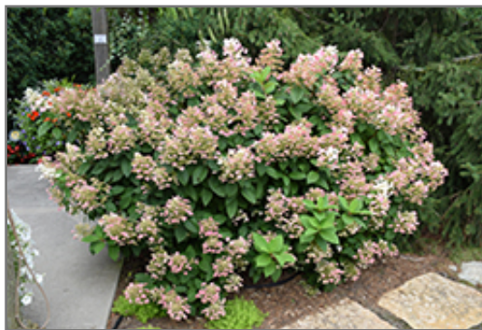
Little Quick Fire Hydrangea in bloom