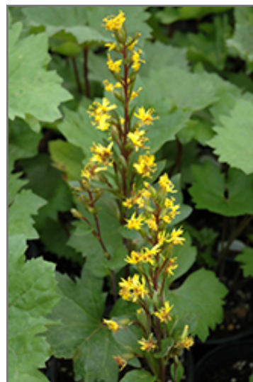
Bottle Rocket Rayflower flowers

Bottle Rocket Rayflower will grow to be about 26 inches tall at maturity, with a spread of 26 inches. It grows at a medium rate, and under ideal conditions can be expected to live for approximately 20 years. As an herbaceous perennial, this plant will usually die back to the crown each winter, and will regrow from the base each spring. Be careful not to disturb the crown in late winter when it may not be readily seen!