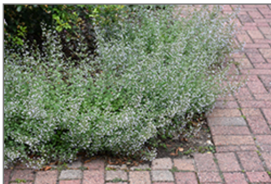
Blue Cloud Dwarf Calamint in bloom

Blue Cloud Dwarf Calamint is recommended for the following landscape applications;