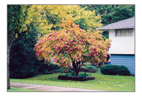
Pee Gee Hydrangea in bloom