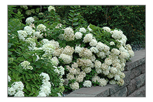
Pee Gee Hydrangea in bloom