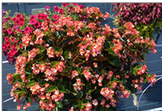
BabyWing Bicolor Begonia in bloom