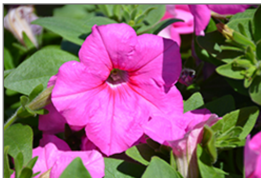
Easy Wave Pink Passion Petunia flowers

Easy Wave Pink Passion Petunia is recommended for the following landscape applications;