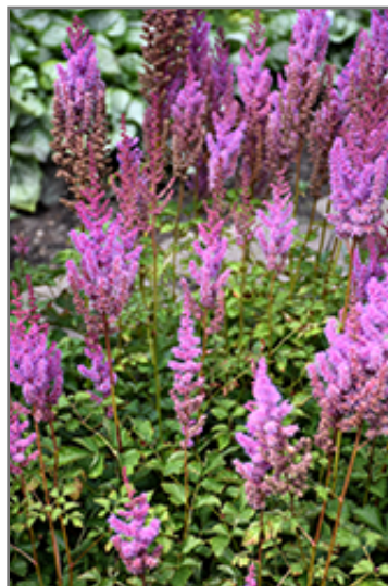
Purple Candles Astilbe flowers