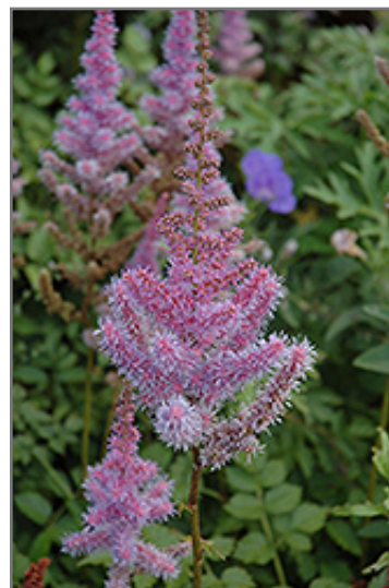
Purple Candles Astilbe flowers