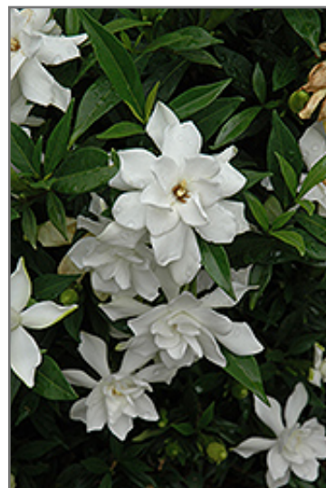
Frost Proof Hardy Gardenia flowers

This is a dense multi-stemmed evergreen houseplant with an upright spreading habit of growth. This plant may benefit from an occasional pruning to look its best.