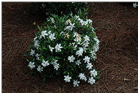
Frost Proof Hardy Gardenia in bloom