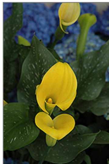
Gold Rush Calla Lily flowers

When grown indoors, Gold Rush Calla Lily can be expected to grow to be about 28 inches tall at maturity, with a spread of 28 inches. It grows at a medium rate, and under ideal conditions can be expected to live for approximately 10 years. This houseplant will do well in a location that gets either direct or indirect sunlight, although it will usually require a more brightly-lit environment than what artificial indoor lighting alone can provide. It requires an evenly moist well-drained soil for optimal growth. The surface of the soil shouldn't be allowed to dry out completely, and so you should expect to water this plant once and possibly even twice each week. Be aware that your particular watering schedule may vary depending on its location in the room, the pot size, plant size and other conditions; if in doubt, ask one of our experts in the store for advice. It is not particular as to soil type or pH; an average potting soil should work just fine. Be warned that parts of this plant are known to be toxic to humans and animals, so special care should be exercised if growing it around children and pets.