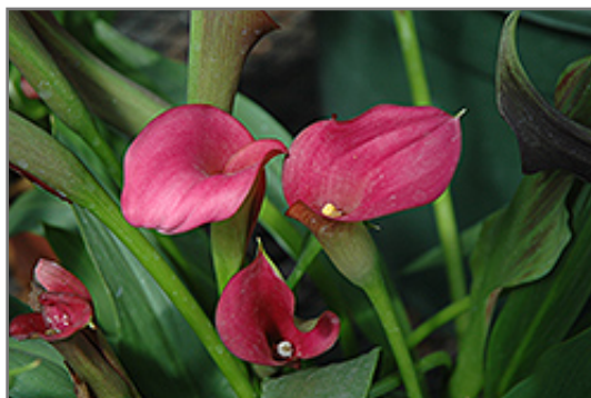
Neon Amour Calla Lily flowers

Other Names: Lily of the Nile, Easter Lily, Arum Lily