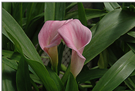
Ruby Sensation Calla Lily flowers

When grown indoors, Ruby Sensation Calla Lily can be expected to grow to be about 28 inches tall at maturity, with a spread of 28 inches. It grows at a medium rate, and under ideal conditions can be expected to live for approximately 10 years. This houseplant will do well in a location that gets either direct or indirect sunlight, although it will usually require a more brightly-lit environment than what artificial indoor lighting alone can provide. It requires an evenly moist well-drained soil for optimal growth. The surface of the soil shouldn't be allowed to dry out completely, and so you should expect to water this plant once and possibly even twice each week. Be aware that your particular watering schedule may vary depending on its location in the room, the pot size, plant size and other conditions; if in doubt, ask one of our experts in the store for advice. It is not particular as to soil type or pH; an average potting soil should work just fine. Be warned that parts of this plant are known to be toxic to humans and animals, so special care should be exercised if growing it around children and pets.