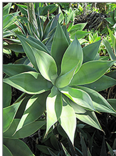
Boutin Blue Foxtail Agave foliage

An appealing variety producing a rosette of wide, powder blue foliage on smooth gray stems that can reach 4 feet; infrequent flower stalks curve toward the ground, then arch back upward, resembling a fox's tail; a great indoor accent planting