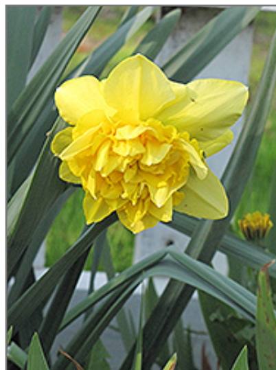
Double Campernelle Daffodil flowers

When grown indoors, Double Campernelle Daffodil can be expected to grow to be about 16 inches tall at maturity, with a spread of 18 inches. It grows at a medium rate, and under ideal conditions can be expected to live for approximately 10 years. This houseplant will do well in a location that gets either direct or indirect sunlight, although it will usually require a more brightly-lit environment than what artificial indoor lighting alone can provide. It does best in average to evenly moist soil, but will not tolerate standing water. The surface of the soil shouldn't be allowed to dry out completely, and so you should expect to water this plant once and possibly even twice each week. Be aware that your particular watering schedule may vary depending on its location in the room, the pot size, plant size and other conditions; if in doubt, ask one of our experts in the store for advice. It is not particular as to soil type or pH; an average potting soil should work just fine.