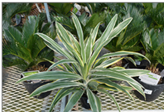
Warneckii Dracaena

There are many factors that will affect the ultimate height, spread and overall performance of a plant when grown indoors; among them, the size of the pot it's growing in, the amount of light it receives, watering frequency, the pruning regimen and repotting schedule. Use the information described here as a guideline only; individual performance can and will vary. Please contact the store to speak with one of our experts if you are interested in further details concerning recommendations on pot size, watering, pruning, repotting, etc.