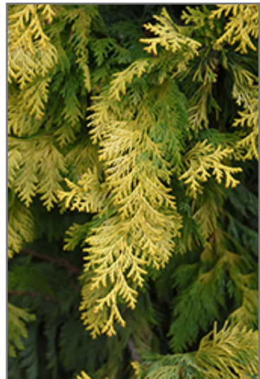
Cripps Gold Falsecypress foliage