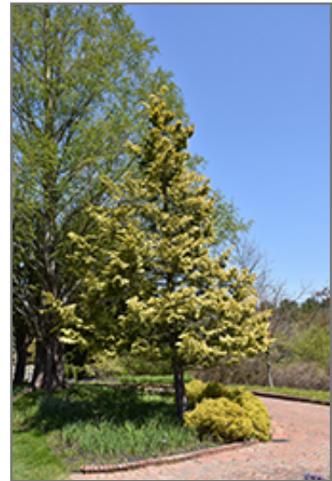
Cripps Gold Falsecypress

This tree does best in full sun to partial shade. It prefers to grow in average to moist conditions, and shouldn't be allowed to dry out. It is not particular as to soil type or pH. It is highly tolerant of urban pollution and will even thrive in inner city environments, and will benefit from being planted in a relatively sheltered location. Consider applying a thick mulch around the root zone in winter to protect it in exposed locations or colder microclimates. This is a selected variety of a species not originally from North America.