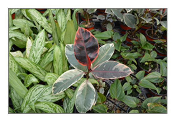
Tricolor Rubber Tree

When grown indoors, Tricolor Rubber Tree can be expected to grow to be about 10 feet tall at maturity, with a spread of 5 feet. It grows at a medium rate, and under ideal conditions can be expected to live for approximately 50 years. This houseplant will do well in a location that gets either direct or indirect sunlight, although it will usually require a more brightly-lit environment than what artificial indoor lighting alone can provide. It prefers dry to average moisture levels with very well-drained soil, and may die if left in standing water for any length of time. This plant should be watered when the surface of the soil gets dry, and will need watering approximately once each week. Be aware that your particular watering schedule may vary depending on its location in the room, the pot size, plant size and other conditions; if in doubt, ask one of our experts in the store for advice. It is not particular as to soil type or pH; an average potting soil should work just fine.