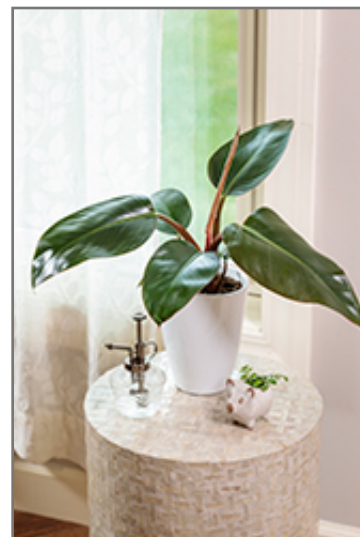
PrismaColor Rojo Congo Philodendron in full

When grown indoors, PrismaColor Rojo Congo Philodendron can be expected to grow to be about 24 inches tall at maturity, with a spread of 24 inches. It grows at a fast rate, and under ideal conditions can be expected to live for approximately 10 years. This houseplant performs well in both bright or indirect sunlight and strong artificial light, and can therefore be situated in almost any well-lit room or location. It prefers to grow in average to moist soil. The surface of the soil shouldn't be allowed to dry out completely, and so you should expect to water this plant once and possibly even twice each week. Be aware that your particular watering schedule may vary depending on its location in the room, the pot size, plant size and other conditions; if in doubt, ask one of our experts in the store for advice. It is not particular as to soil type or pH; an average potting soil should work just fine. Be warned that parts of this plant are known to be toxic to humans and animals, so special care should be exercised if growing it around children and pets.