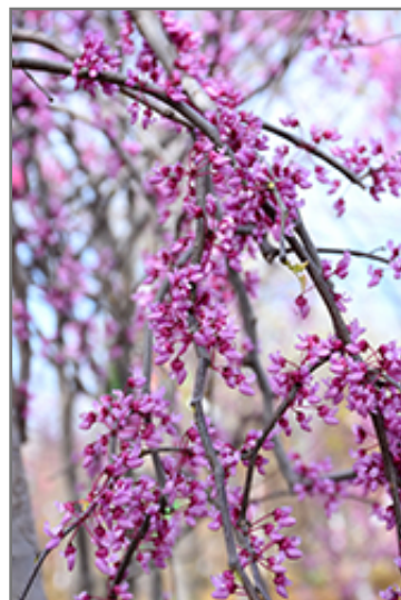
Pink Heartbreaker Redbud flowers

Pink Heartbreaker Redbud is recommended for the following landscape applications;