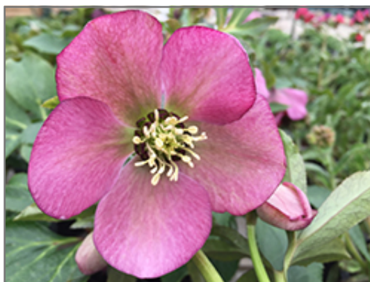
Honeymoon Paris In Pink Hellebore flowers