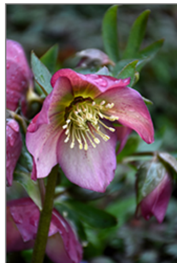
Honeymoon Paris In Pink Hellebore flowers

Honeymoon Paris In Pink Hellebore is recommended for the following landscape applications;