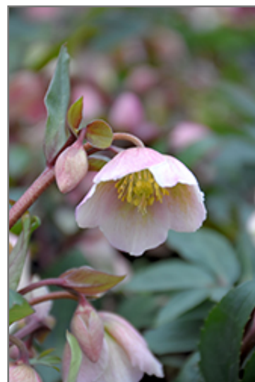
Winterbells Hellebore flowers