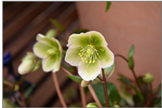
Winterbells Hellebore flowers

This is an herbaceous evergreen houseplant with an upright spreading habit of growth. This plant may benefit from an occasional pruning to look its best.