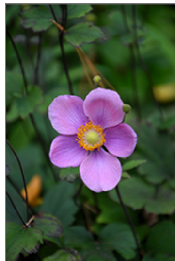
Lucky Charm Anemone flowers