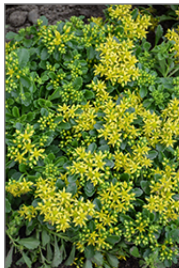
Little Miss Sunshine Stonecrop flowers

Little Miss Sunshine Stonecrop is recommended for the following landscape applications;