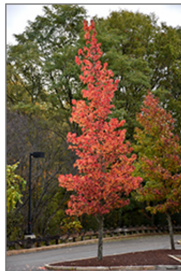
Sweet Gum in fall