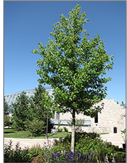
Sweet Gum

This tree should only be grown in full sunlight. It prefers to grow in average to moist conditions, and shouldn't be allowed to dry out. It is very fussy about its soil conditions and must have rich, acidic soils to ensure success, and is subject to chlorosis (yellowing) of the foliage in alkaline soils. It is somewhat tolerant of urban pollution. This species is native to parts of North America.