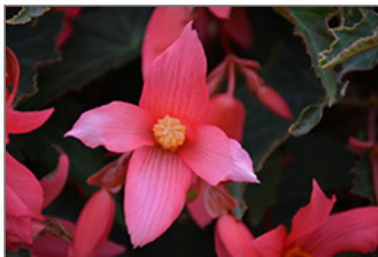
Bossa Nova Pink Glow Begonia flowers