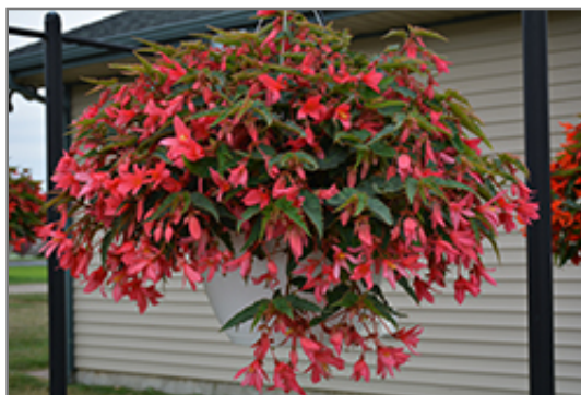
Bossa Nova Pink Glow Begonia in bloom

Bossa Nova Pink Glow Begonia is a fine choice for the garden, but it is also a good selection for planting in outdoor containers and hanging baskets. Because of its trailing habit of growth, it is ideally suited for use as a 'spiller' in the 'spiller-thriller-filler' container combination; plant it near the edges where it can spill gracefully over the pot. Note that when growing plants in outdoor containers and baskets, they may require more frequent waterings than they would in the yard or garden.