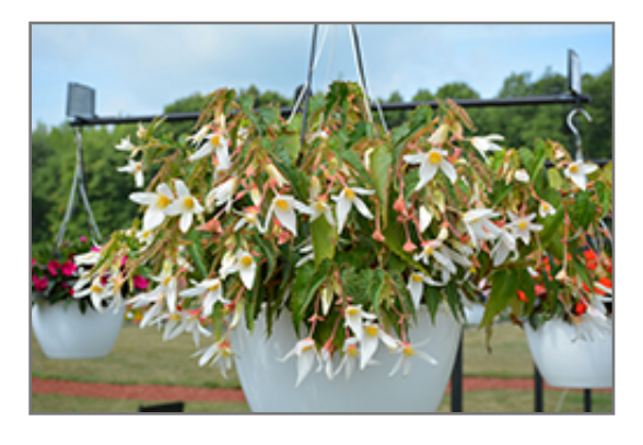
Santa Barbara Begonia in bloom