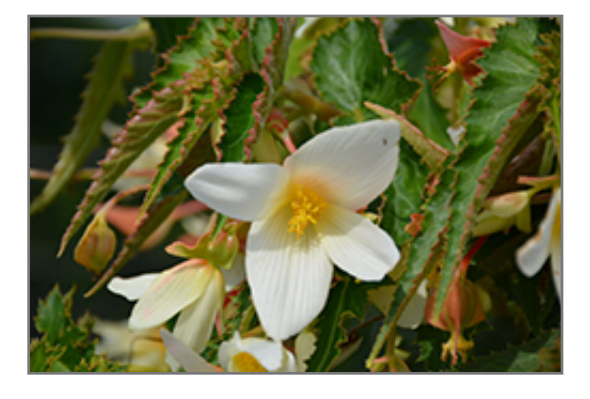
Santa Barbara Begonia flowers