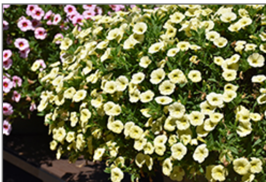
Cabaret Lemon Yellow Calibrachoa flowers

Cabaret Lemon Yellow Calibrachoa will grow to be about 10 inches tall at maturity, with a spread of 18 inches. When grown in masses or used as a bedding plant, individual plants should be spaced approximately 12 inches apart. Its foliage tends to remain low and dense right to the ground. This fast-growing annual will normally live for one full growing season, needing replacement the following year.