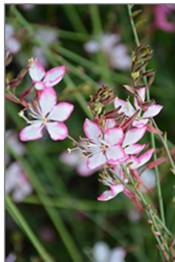
Rosy Jane Gaura flowers

Rosy Jane Gaura is recommended for the following landscape applications;