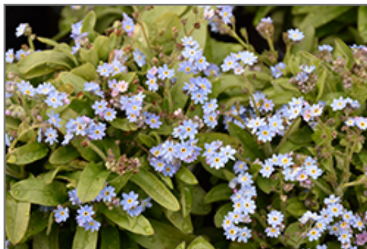
Victoria Blue Forget-Me-Not flowers