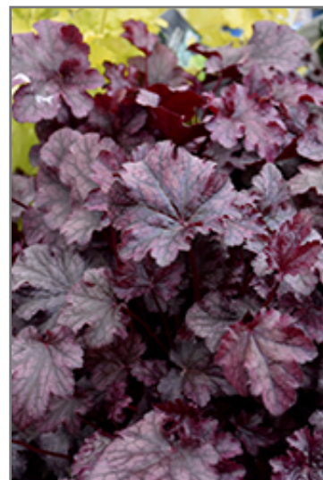
Plum Pudding Coral Bells foliage

Plum Pudding Coral Bells is recommended for the following landscape applications;