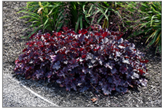
Plum Pudding Coral Bells

Plum Pudding Coral Bells will grow to be only 6 inches tall at maturity extending to 12 inches tall with the flowers, with a spread of 12 inches. When grown in masses or used as a bedding plant, individual plants should be spaced approximately 10 inches apart. Its foliage tends to remain low and dense right to the ground. It grows at a medium rate, and under ideal conditions can be expected to live for approximately 10 years. As an evergreen perennial, this plant will typically keep its form and foliage year-round.