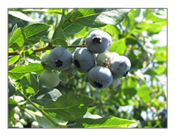
Coville Blueberry fruit

Coville Blueberry features dainty clusters of white bell-shaped flowers with shell pink overtones hanging below the branches in late spring. It has green deciduous foliage. The glossy oval leaves turn yellow and red in fall. It features an abundance of magnificent blue berries in mid summer. The smooth brick red bark adds an interesting dimension to the landscape.