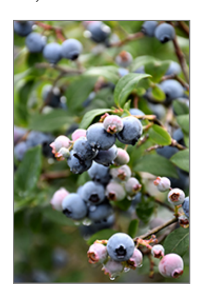
Coville Blueberry fruit