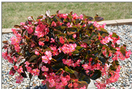
Megawatt Pink Bronze Leaf Begonia in bloom

Megawatt Pink Bronze Leaf Begonia is a fine choice for the garden, but it is also a good selection for planting in outdoor containers and hanging baskets. With its upright habit of growth, it is best suited for use as a 'thriller' in the 'spiller-thriller-filler' container combination; plant it near the center of the pot, surrounded by smaller plants and those that spill over the edges. It is even sizeable enough that it can be grown alone in a suitable container. Note that when growing plants in outdoor containers and baskets, they may require more frequent waterings than they would in the yard or garden.