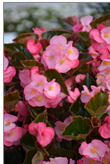
Megawatt Pink Bronze Leaf Begonia flowers

Megawatt Pink Bronze Leaf Begonia is an herbaceous annual with an upright spreading habit of growth. Its medium texture blends into the garden, but can always be balanced by a couple of finer or coarser plants for an effective composition.