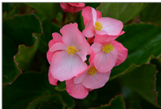
Megawatt Pink Green Leaf Begonia flowers