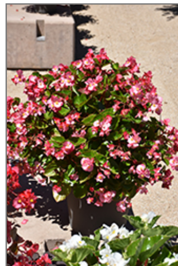
Megawatt Pink Green Leaf Begonia flowers

Megawatt Pink Green Leaf Begonia is a fine choice for the garden, but it is also a good selection for planting in outdoor containers and hanging baskets. With its upright habit of growth, it is best suited for use as a 'thriller' in the 'spiller-thriller-filler' container combination; plant it near the center of the pot, surrounded by smaller plants and those that spill over the edges. It is even sizeable enough that it can be grown alone in a suitable container. Note that when growing plants in outdoor containers and baskets, they may require more frequent waterings than they would in the yard or garden.