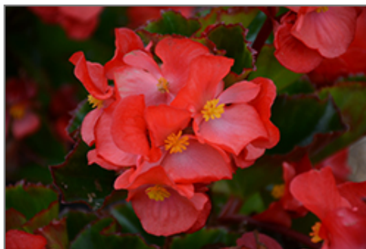
Megawatt Red Green Leaf Begonia flowers