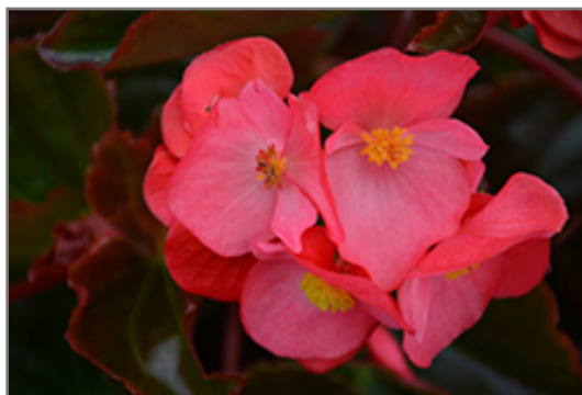
Megawatt Rose Bronze Leaf Begonia flowers

Megawatt Rose Bronze Leaf Begonia is an herbaceous annual with an upright spreading habit of growth. Its medium texture blends into the garden, but can always be balanced by a couple of finer or coarser plants for an effective composition.