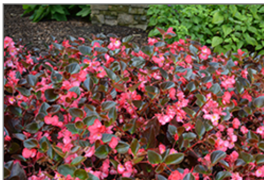
Megawatt Rose Bronze Leaf Begonia in bloom

Megawatt Rose Bronze Leaf Begonia is a fine choice for the garden, but it is also a good selection for planting in outdoor containers and hanging baskets. With its upright habit of growth, it is best suited for use as a 'thriller' in the 'spiller-thriller-filler' container combination; plant it near the center of the pot, surrounded by smaller plants and those that spill over the edges. It is even sizeable enough that it can be grown alone in a suitable container. Note that when growing plants in outdoor containers and baskets, they may require more frequent waterings than they would in the yard or garden.