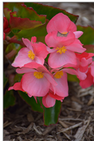
Megawatt Rose Green Leaf Begonia flowers

Megawatt Rose Green Leaf Begonia is an herbaceous annual with an upright spreading habit of growth. Its medium texture blends into the garden, but can always be balanced by a couple of finer or coarser plants for an effective composition.