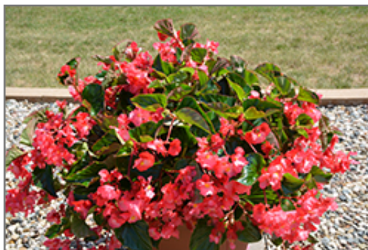
Megawatt Rose Green Leaf Begonia in bloom

Megawatt Rose Green Leaf Begonia is a fine choice for the garden, but it is also a good selection for planting in outdoor containers and hanging baskets. With its upright habit of growth, it is best suited for use as a 'thriller' in the 'spiller-thriller-filler' container combination; plant it near the center of the pot, surrounded by smaller plants and those that spill over the edges. It is even sizeable enough that it can be grown alone in a suitable container. Note that when growing plants in outdoor containers and baskets, they may require more frequent waterings than they would in the yard or garden.