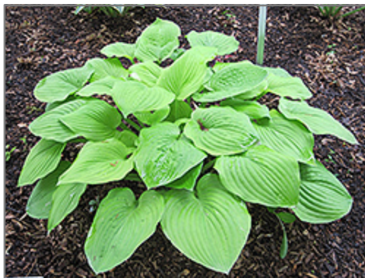
August Moon Hosta