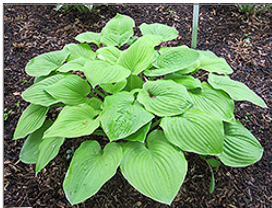
August Moon Hosta