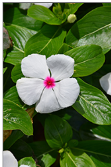
Mega Bloom Polka Dot Vinca flowers

Mega Bloom Polka Dot Vinca is recommended for the following landscape applications;