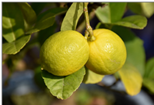
Key Lime fruit