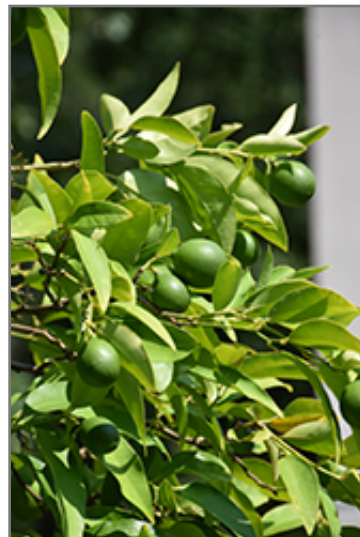
Key Lime fruit