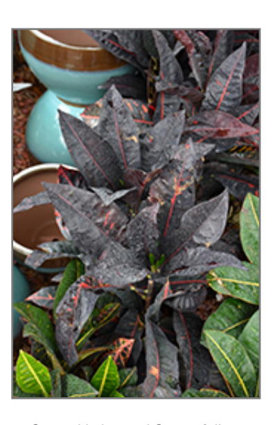
Congo Variegated Croton foliage

When grown indoors, Congo Variegated Croton can be expected to grow to be about 4 feet tall at maturity, with a spread of 3 feet. It grows at a medium rate, and under ideal conditions can be expected to live for approximately 10 years. This houseplant will do well in a location that gets either direct or indirect sunlight, although it will usually require a more brightly-lit environment than what artificial indoor lighting alone can provide. It does best in average to evenly moist soil, but will not tolerate standing water. The surface of the soil shouldn't be allowed to dry out completely, and so you should expect to water this plant once and possibly even twice each week. Be aware that your particular watering schedule may vary depending on its location in the room, the pot size, plant size and other conditions; if in doubt, ask one of our experts in the store for advice. It is not particular as to soil pH, but grows best in rich soil. Contact the store for specific recommendations on pre-mixed potting soil for this plant. Be warned that parts of this plant are known to be toxic to humans and animals, so special care should be exercised if growing it around children and pets.