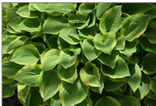
Golden Tiara Hosta foliage