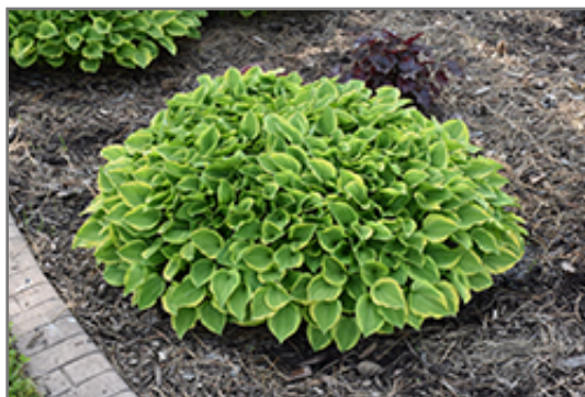
Golden Tiara Hosta