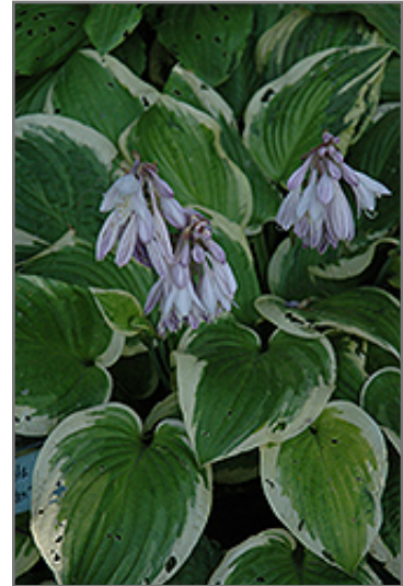
Golden Tiara Hosta flowers

Golden Tiara Hosta will grow to be about 12 inches tall at maturity extending to 18 inches tall with the flowers, with a spread of 3 feet. When grown in masses or used as a bedding plant, individual plants should be spaced approximately 30 inches apart. Its foliage tends to remain dense right to the ground, not requiring facer plants in front. It grows at a medium rate, and under ideal conditions can be expected to live for approximately 10 years. As an herbaceous perennial, this plant will usually die back to the crown each winter, and will regrow from the base each spring. Be careful not to disturb the crown in late winter when it may not be readily seen!